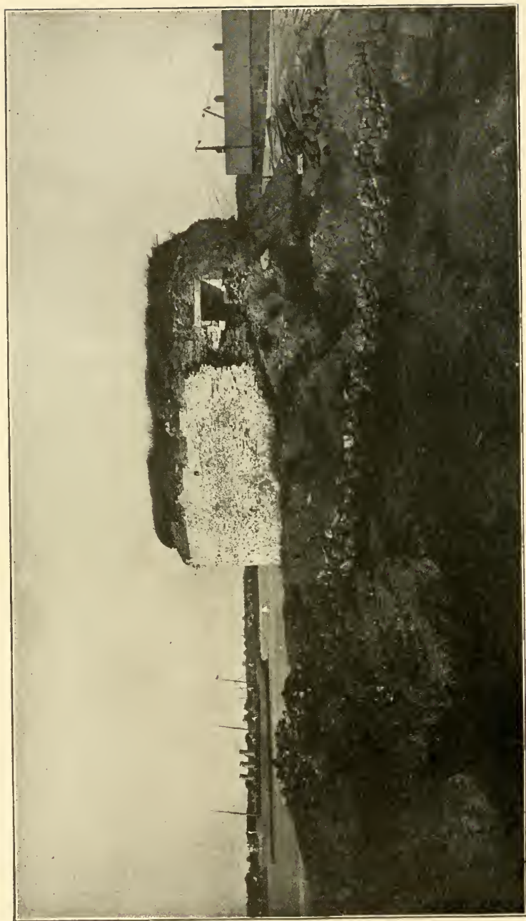
RUINS OF WALBACH TOWER, NEW CASTLE, N. H.